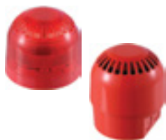
Sounders and Beacons Safe area, intrinsically safe or flameproof options