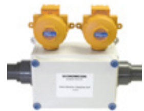
Fan control for Crowcon's Environmental Sampling Unit

Crowcon reserves the right to change the design or specification of the product without notice. Check www.crowcon.com for updates.