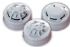
Up to 20 fire/heat detectors per zone