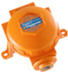
Industry-standard gas detectors