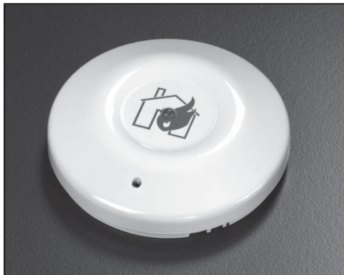
Part no: 53832-070

The MiniDisc Remote Indicator is polarity sensitive. Connect positive line to Terminal A or B and negative line to Terminal C (See table opposite)